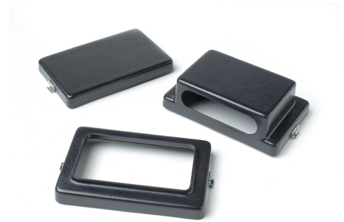
Phantom includes detachable scanning wells and air tight case.